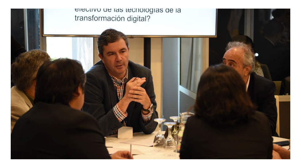
Fig. 1: Dialogue held in Montevideo on 16 November 2022 using the World Café methodology.